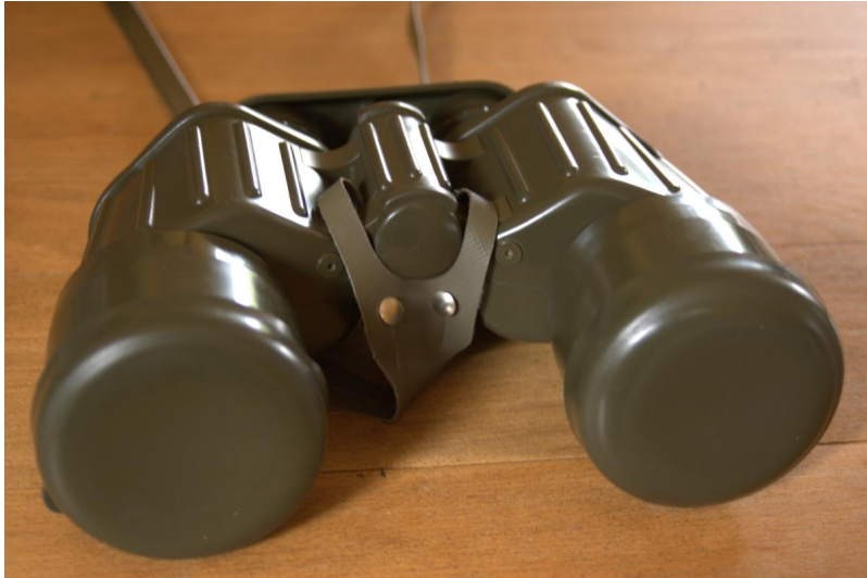
Zeiss-Hensoldt Fero-D 19 10x50 M